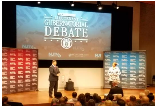
NJTV and Montclair State University co-hosted the 2017 Lieutenant Gubernatorial Debate