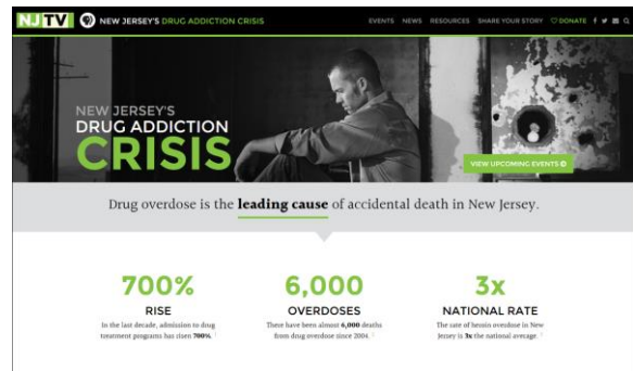
NJTV's Healthy NJ: New Jersey's Drug Addiction Crisis initiative website

NJTV continues to populate its New Jersey's Drug Addiction Crisis website with important information, news and other resources about the initiative and the issue itself. This includes addiction service information from statewide organizations and the latest news stories on the subject from NJTV News and other media. This site continues to be a one-stop shop for all things related to addiction, treatment, prevention and recovery.