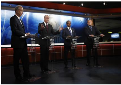
2017 Democratic Gubernatorial Primary Debate at the Agnes Varis NJTV Studio