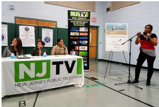
NJTV's In Your Neighborhood Community Forum in New Brunswick