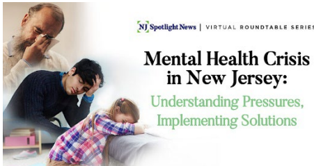
NJ Spotlight News | VIRTUAL ROUNDTABLE SERIES Mental Health Crisis in New Jersey: Understanding Pressures, Implementing Solutions

NJ PBS is a beacon for community discussion and engagement, hosting and participating in special local events throughout the year to spotlight topical issues and encourage public conversation, including these in 2023: